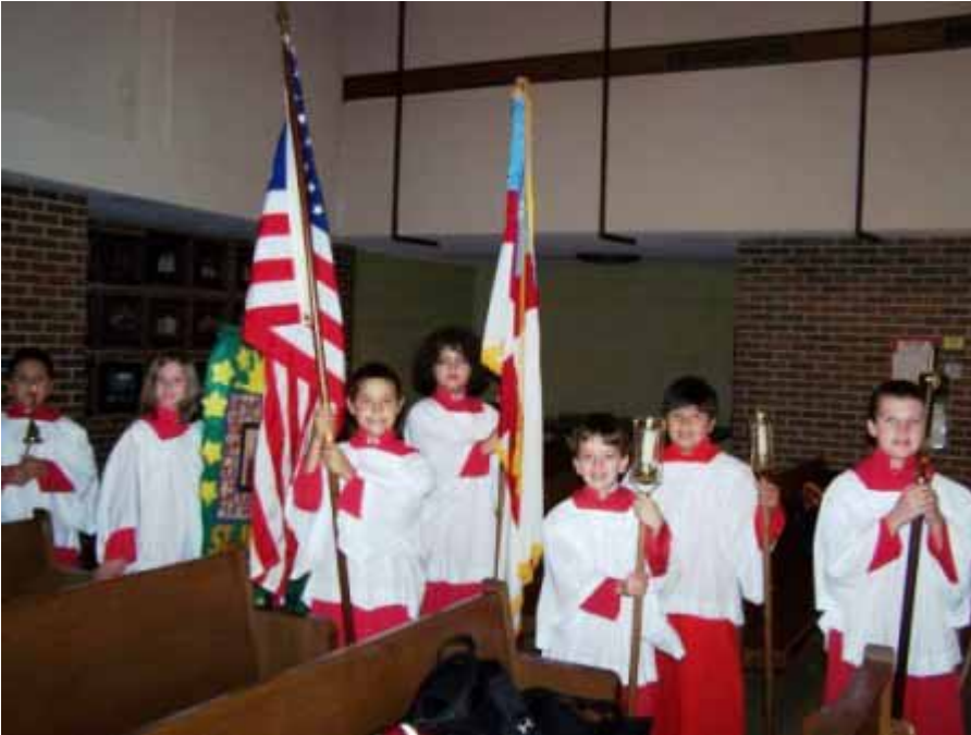
Fifth Grade Acolytes